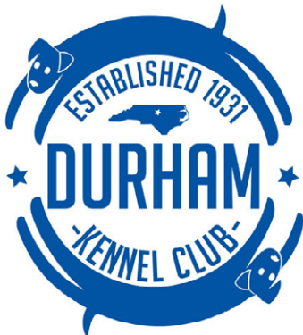
Proposed Logo #4