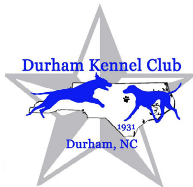
Proposed Logo #5